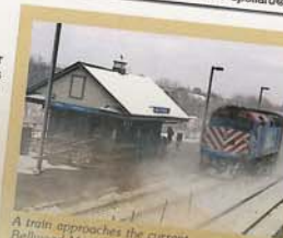
A train approaches the current Bellwood Metro station.

NOVEMBER 26, 2008 • A PIONEER PRESS PUBLICATION • $1.25 December 10, 2008 • By DAVID POLLARD dpollard@pioneerlocal.com